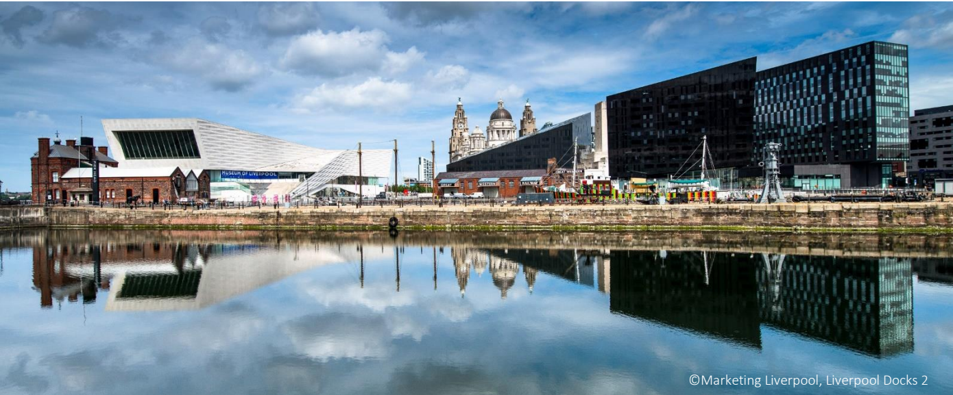
Liverpool Docks 2

Liverpool is a city with unique attractions, exciting events, world class sport offerings, unrivalled musical heritage and a famously warm welcome!