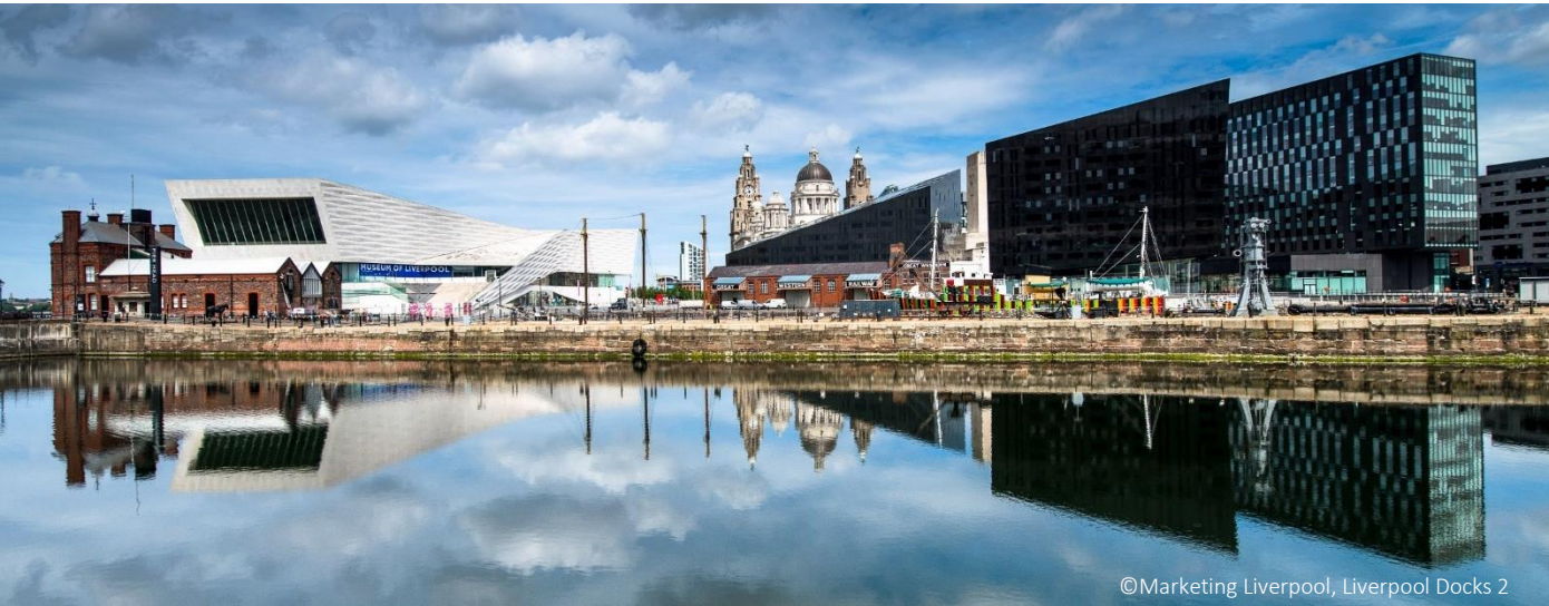
Liverpool Docks 2

Liverpool is a city with unique attractions, exciting events, world class sport offerings, unrivalled musical heritage and a famously warm welcome!