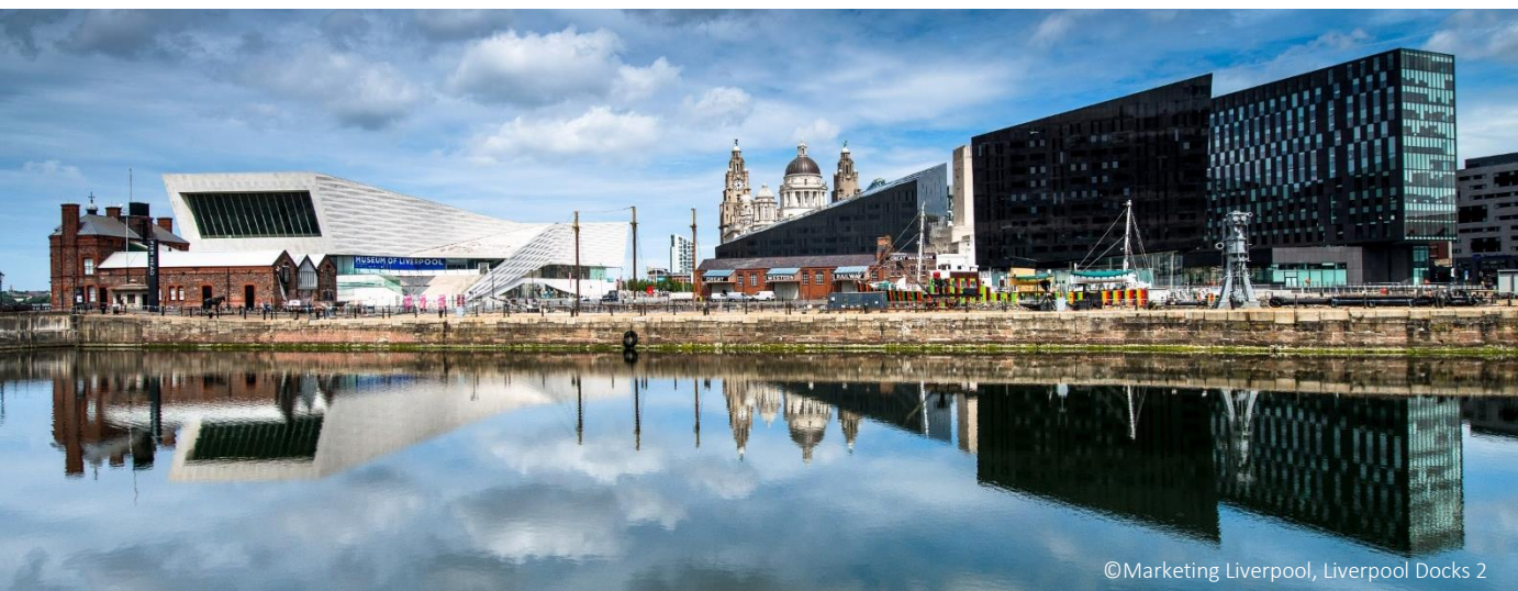
Liverpool Docks 2

Liverpool is a city with unique attractions, exciting events, world class sport offerings, unrivalled musical heritage and a famously warm welcome!