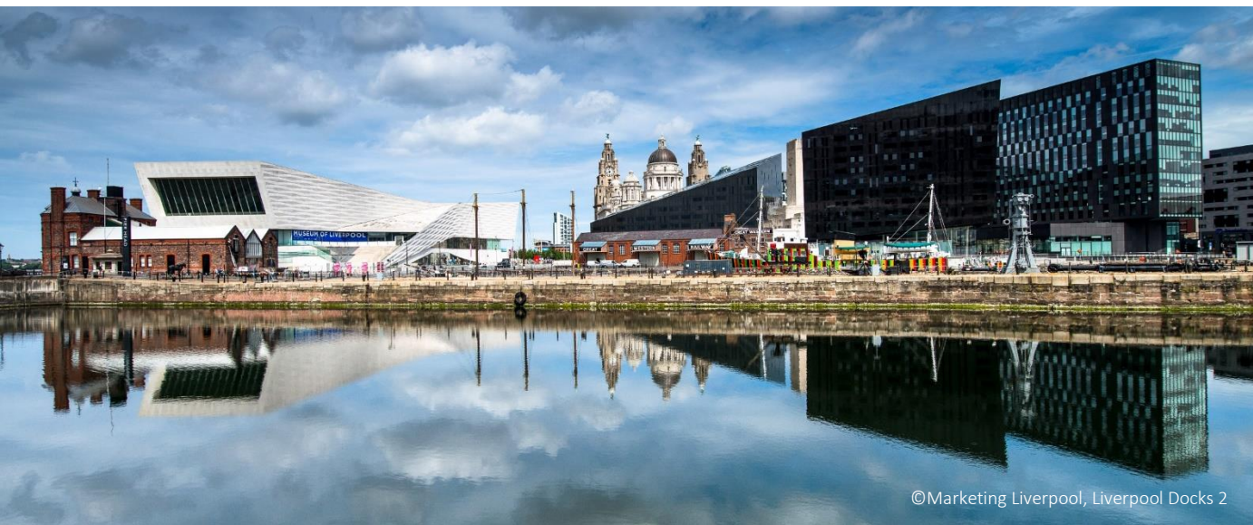
Liverpool Docks 2

Liverpool is a city with unique attractions, exciting events, world class sport offerings, unrivalled musical heritage and a famously warm welcome!